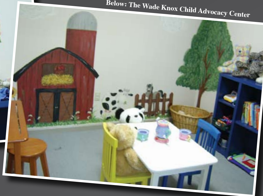
Below: The Wade Knox Child Advocacy Center